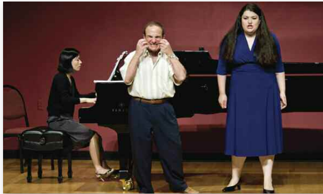
"Iris, Hence Away!"